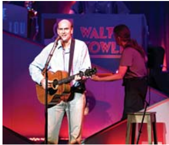
James Taylor performing at the 2008 Chicago Ravinia Festival

A Sound Choice and Masque Sound provided the audio gear for the 2008 Ravinia Festival located in Highland Park, Ill., just 20 miles north of Chicago. A fixture of the city's summer entertainment scene since 1904, The Ravinia Experience features three venues: the 3,200-seat open-air Pavilion; the 850-seat Martin Theatre and the 450-seat Bennett Gordon Recital Hall. Performers during the 2008 season included dozens of genre-spanning artists such as James Taylor (pictured), Lyle Lovett, the Emerson String Quartet, Backstreet Boys and Chicago blues icon Buddy Guy.