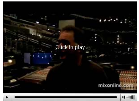
Live Sound for the 2009 Presidential Inaugural Celebration